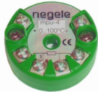
two-wire input transducer mpu-4

The transducer mpu-4 mounted in a stable Polyamide case - especially suits for temperature sensors with wiring but without connecting head.